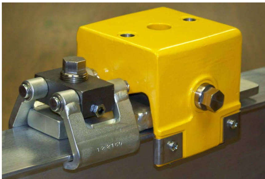
MODEL 2550 SINGLE ROLLER ADAPTER-P/N 104568* NSN 1730-00-986-3702*