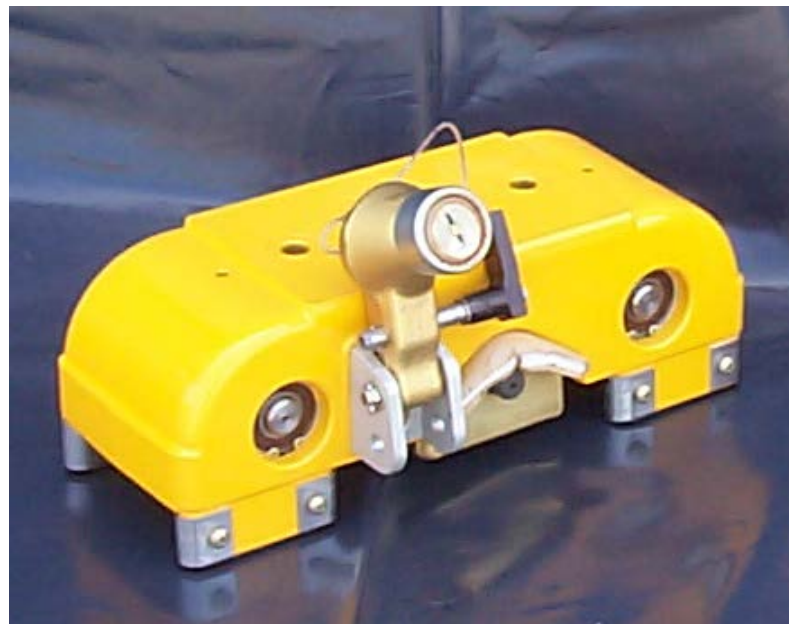
MODEL 2620 DOUBLE ROLLER ADAPTER- P/N 105612* (MODEL 2610-P/N 105710* WITHOUT UPLOAD ADAPTER)